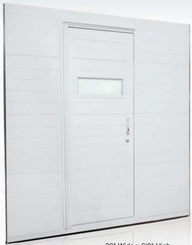
32" Wide x 6'8" High Windows Available

Minimum of 60" of high lift is required for 500 series pass doors