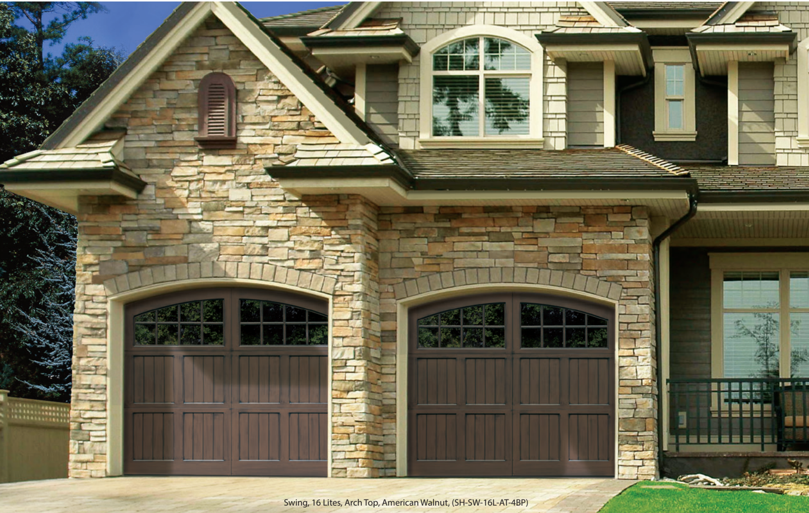
Swing, 16 Lites, Arch Top, American Walnut, (SH-SW-16L-AT-4BP)