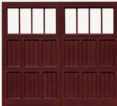
Swing, 8 Lites, Traditional Mahogany, (SH-SW-8L-6BP)